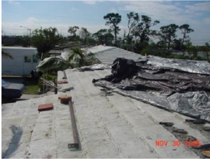
12 ROOF DAMAGE 11/30/2005 4 front slope