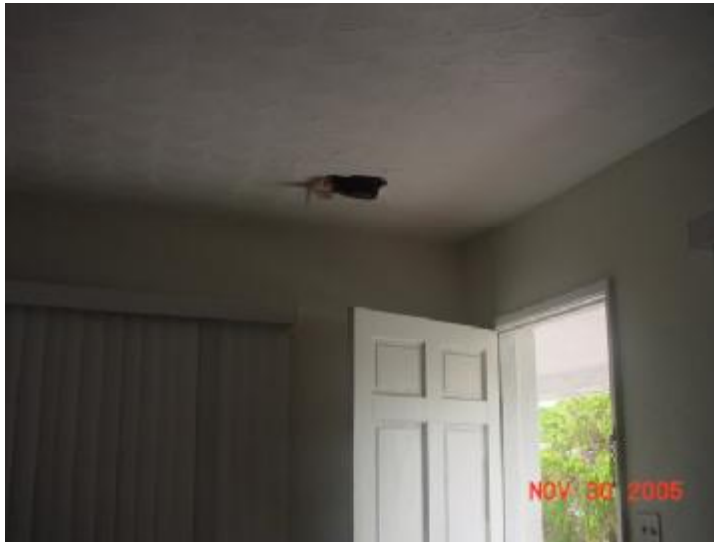
3 LIVING ROOM 11/30/2005 WATER DAMAGED TEXTURE CEILING