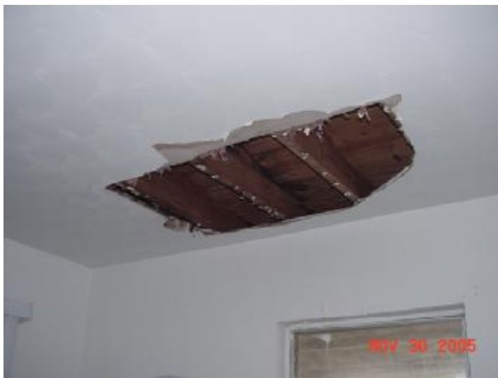
4 BEDROOM CEILING 11/30/2005 water damaged drywall ceiling with heavy texture