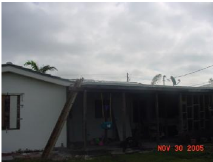
2 RISK REAR 11/30/2005