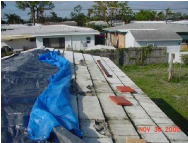
13 ROOF DAMAGE 11/30/2005 5 Rear slope