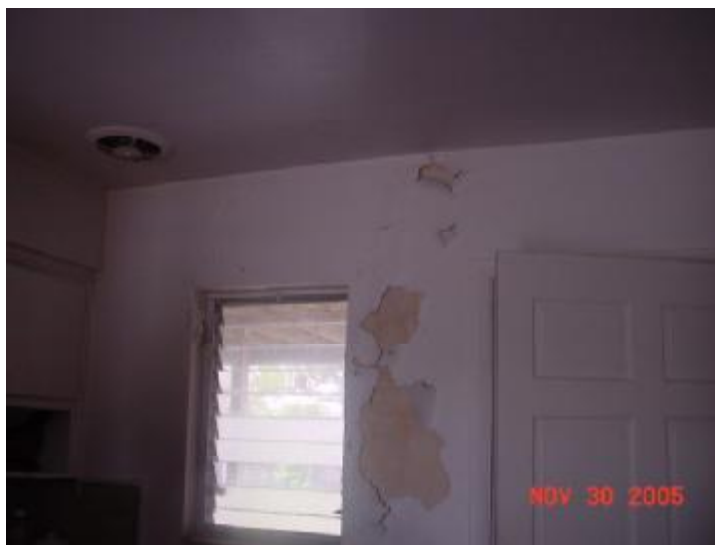
6 KITCHEN 11/30/2005 WATER DAMAGED WALL