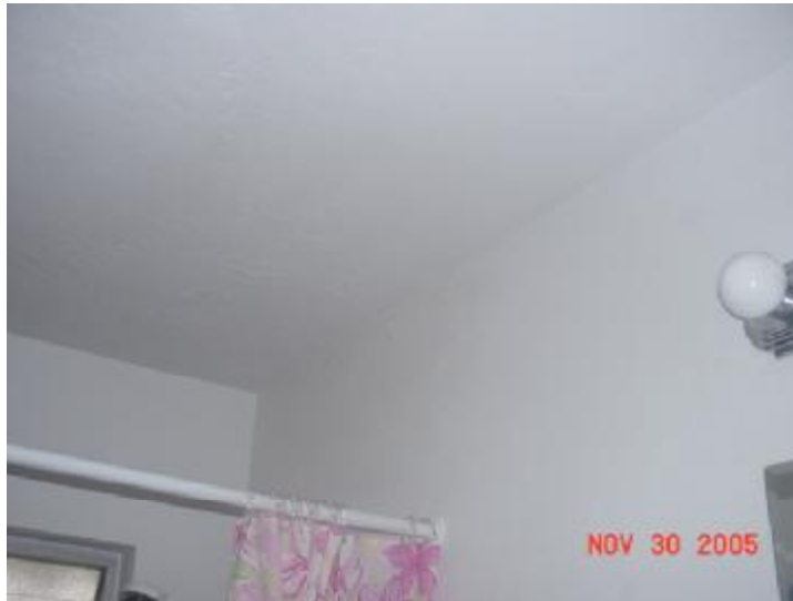
5 BATHROOM CEILING 11/30/2005 LIGHT WATER STAINS