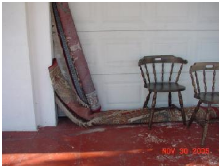
14 RUGS 11/30/2005 water damaged placement rugs