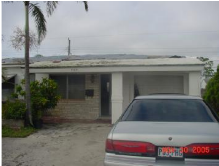
1 FRONT RISK 11/30/2005