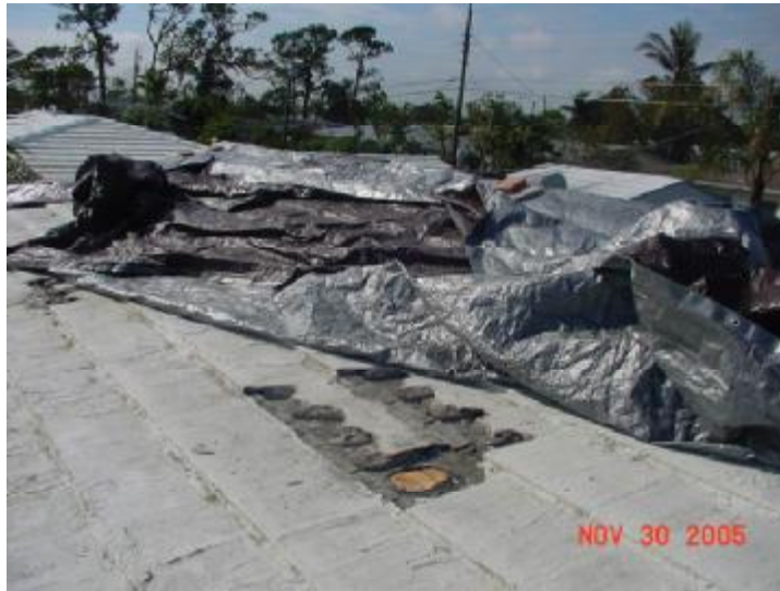
11 ROOF DAMAGE 11/30/2005 3 front slope